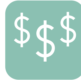
Cost Benefit Analysis Model