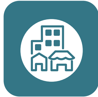
Project Portfolio Review & Analysis