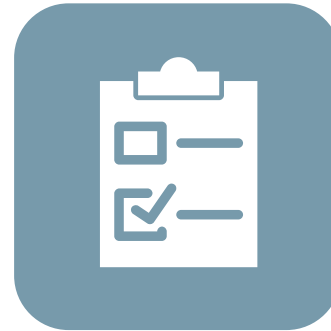
Project Satisfaction Survey Analysis